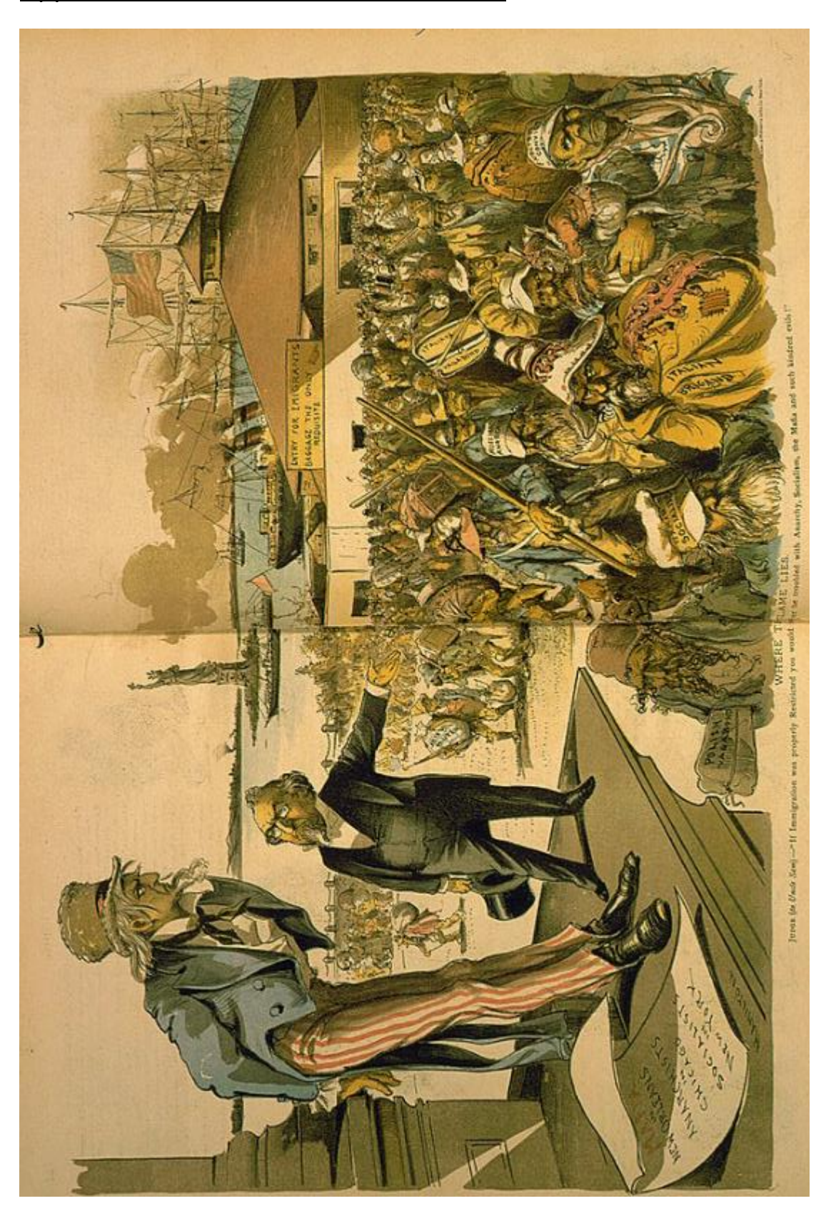
Appendix 11 "Where the Blame Lies"