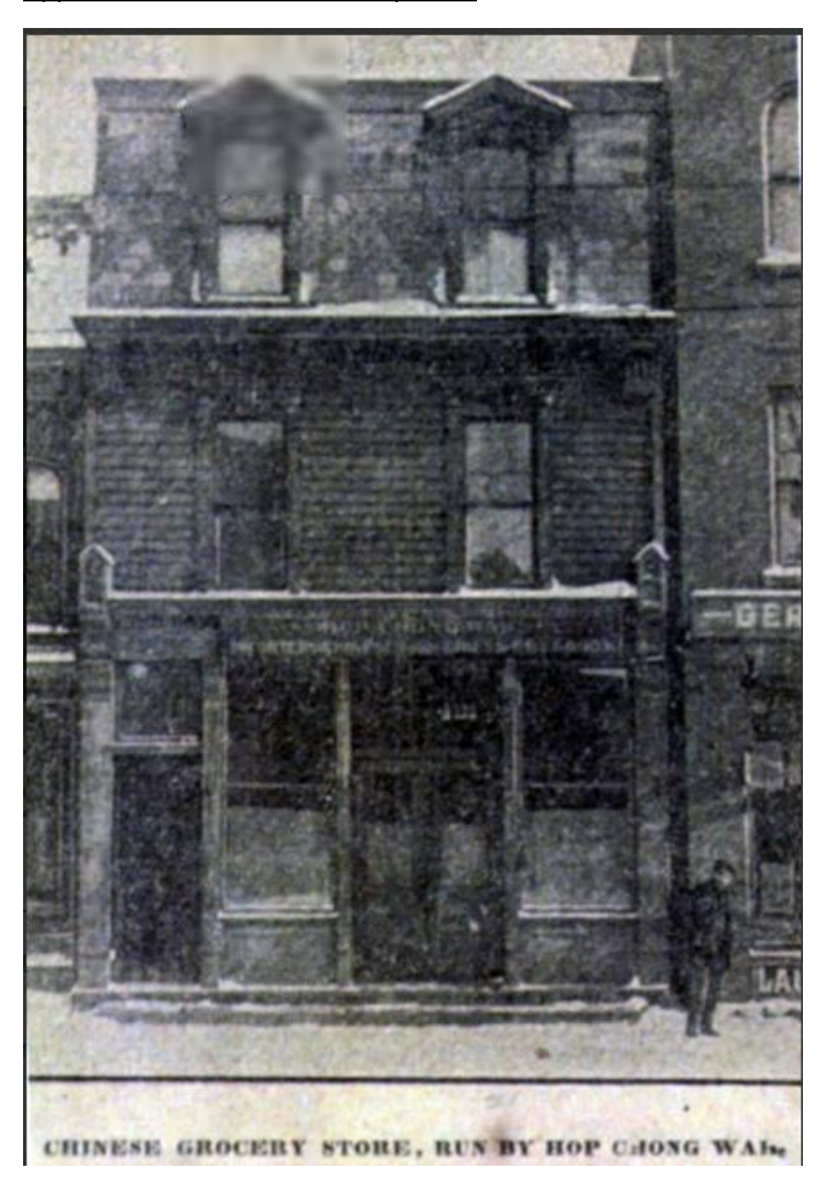
Appendix 6 Chinese Grocery Store