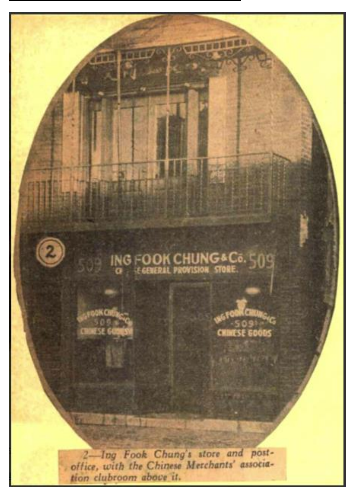
Appendix 7 Chinese Merchant's Association