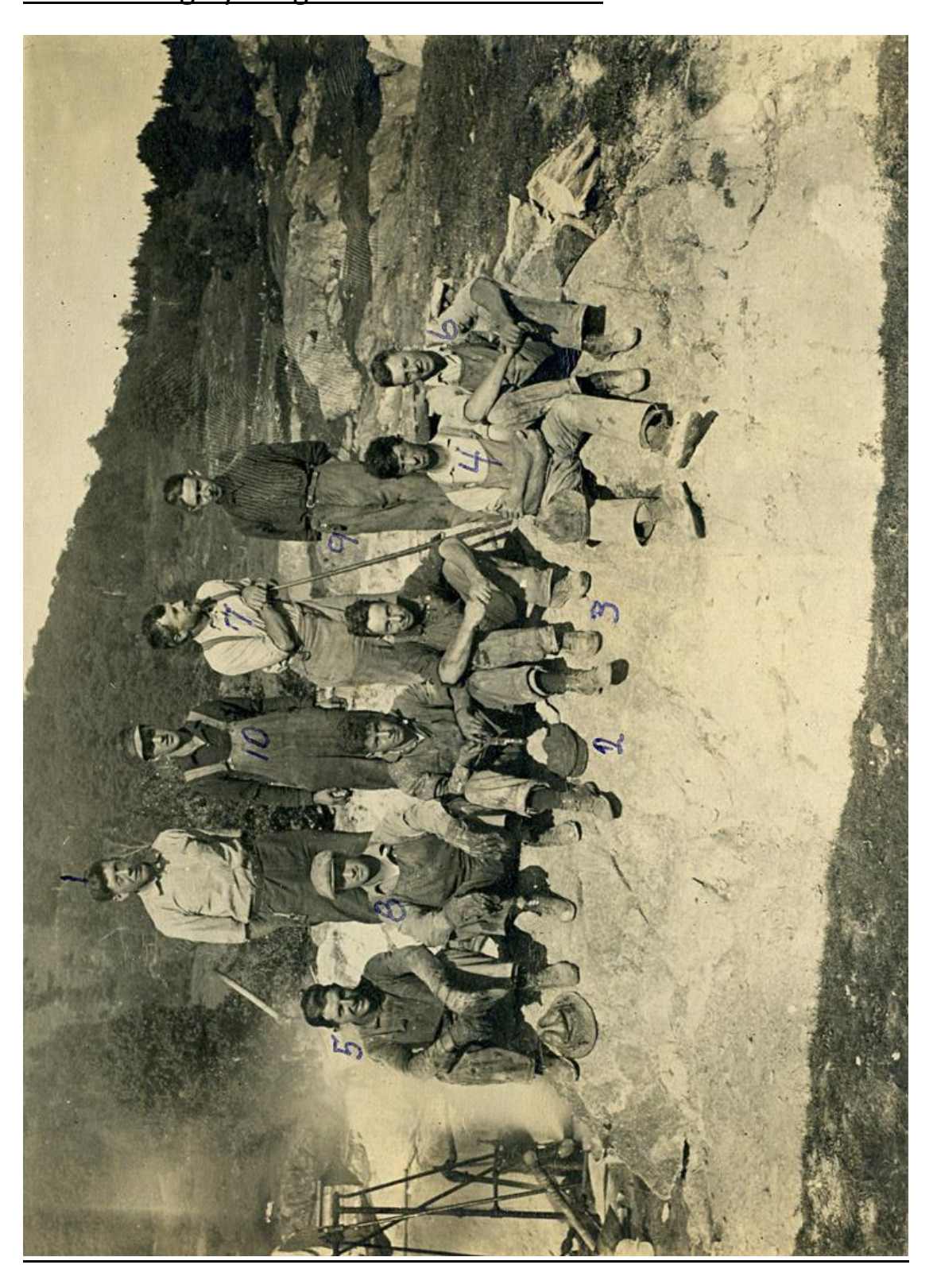
Appendix 5 – Some immigrants, like Italian marble workers, came to the U.S. with highly sought and valuable skills.